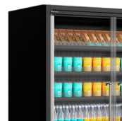
Full height doors