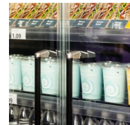
Frameless glass doors