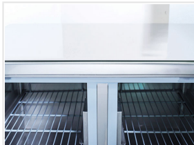
Anti-condensation thermal-braker on door frame