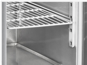
Curved edge for easy cleaning