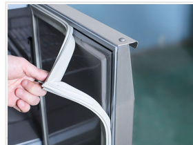
Inner embossed door design for a better sealing