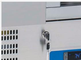
Engine room lock fitted as standard